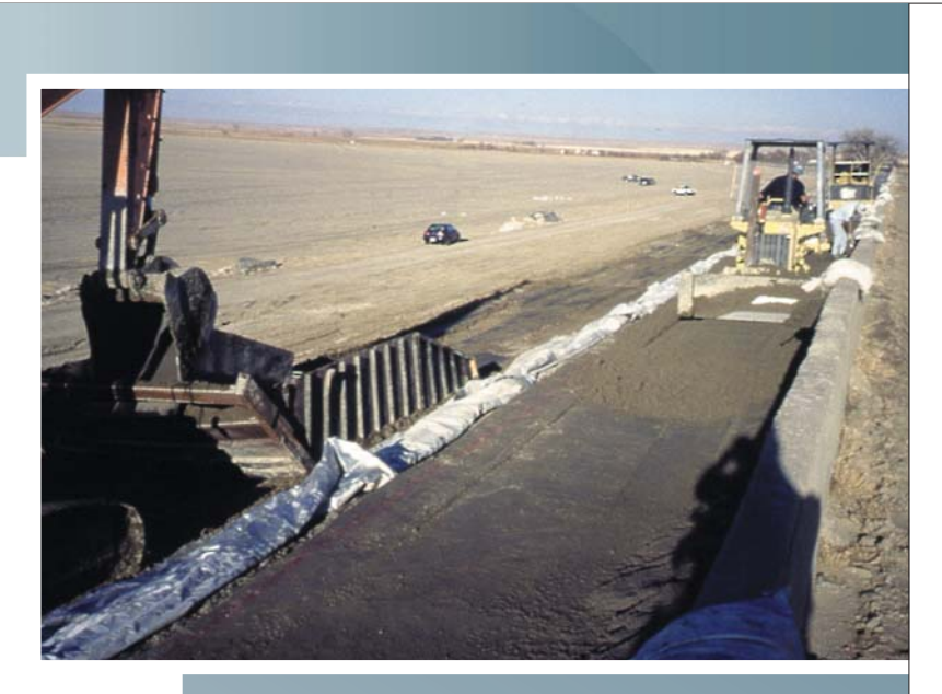
Soil-cement placement operations adjacent to existing concrete parapet at crest of dam.

Rehabilitation consisted of constructing a cutoff extending 3 to 5 feet (1 to 1.5 m) below the