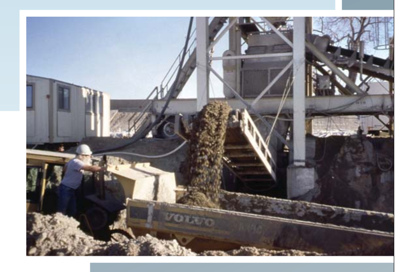
Soil-cement batch plant located within drained reservoir.

■ The placement width of soil-cement layers is limited by compaction equipment rather than the size of truck delivering the product.