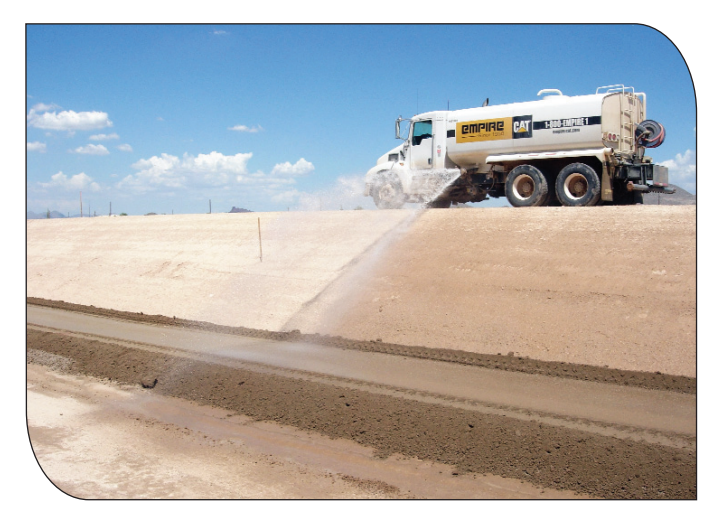
Moist curing with water truck

production rates averaged 2,000 to 2,500 cubic yards (1,500 to 1,900 m<sup>3</sup>), depending on available approved areas for placement. Placement was commonly alternated each day from the downstream side to the upstream side of the levee. Once each side reached the crest of the soil core, the remaining three foot (0.91 m) thick soil-cement cap was placed in lifts covering the entire width of the levee. The project required a total of 114,200 cubic yards (87,300 m<sup>3</sup>) of soil-cement, which included 13,900 tons (12,600 metric tons) of portland cement. The total cost of in-place soil-cement was $35.50 per cubic yard ($46.43/m<sup>3</sup>). This cost included cost of materials, mixing, transporting, placing and curing.