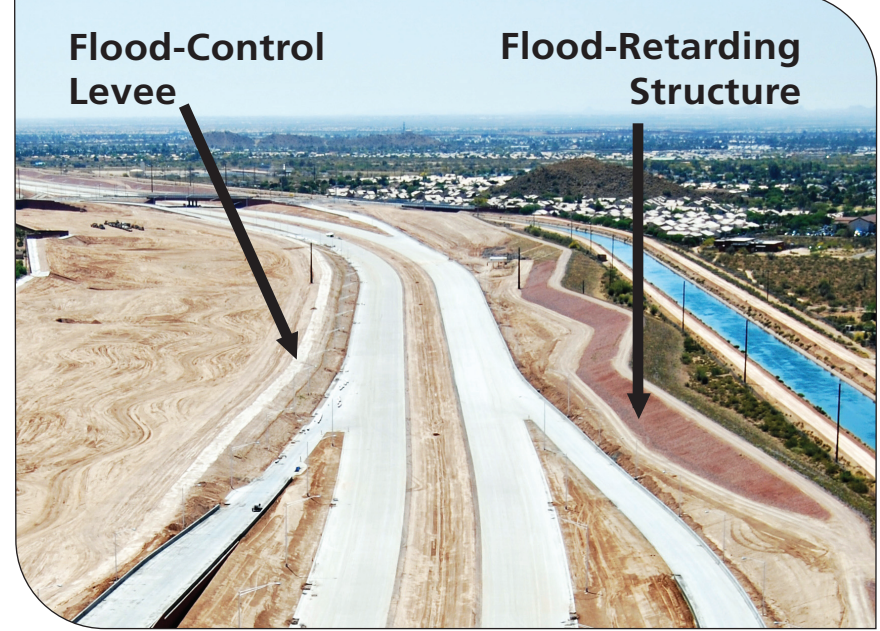
General view of project after substantial completion

Placement of the Red Mountain Freeway within the existing FRS flood pool proved to be the preferred alignment alternative. However, to accommodate the freeway, 100-year flood protection had to be provided and a portion of the existing flood pool capacity had to be reclaimed upstream of the freeway alignment to meet Arizona Department of Water Resources (ADWR) dam safety regulations. This was accomplished by construction of the flood-control levee within the existing flood pool and upstream of the FRS and the removal of approximately 2 million cubic yards (1.5 million m<sup>3</sup>) of material during the freeway construction project. The soil-