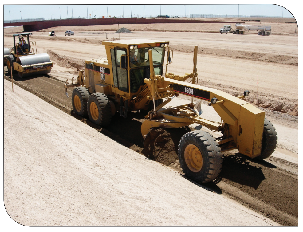
Spreading and rolling soil-cement

The contractor prepared the levee foundation and AMEC, ADOT and ADWR checked and approved the foundation prior to placement of the soil-cement. Foundation preparation included removal of the Holocene alluvial overburden soils to expose the more competent underlying the Pleistocene cemented soils. Once the foundation was prepared and approved, the levee earthen core was constructed. The designer selected to use a structural fill core to reduce the quantity of soil-cement required for the levee and to reduce cost.