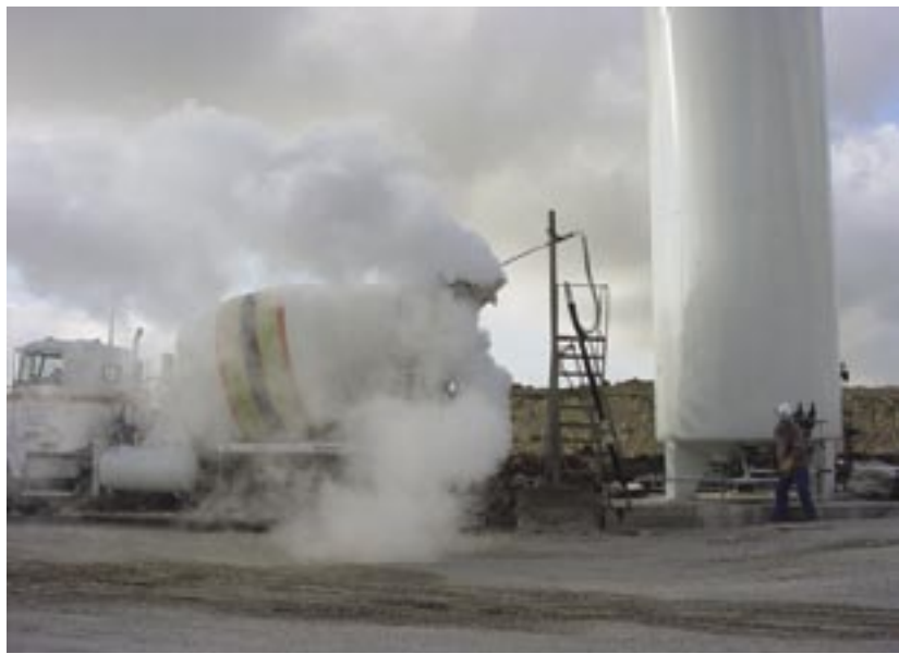
Fig. 1: The LN lance is connected to tubing and is inserted into the mixer, spraying LN on the top of the mixing concrete

“For those of us in the construction trades, LN appears