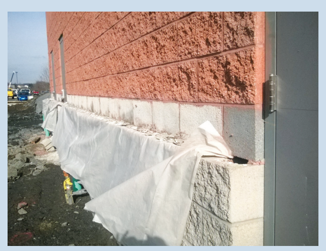
Figure 5. To prevent unwanted buildup and additional cleaning, protecting tops of walls and previously completed work is an essential best practice.

Mortar production should be scheduled to keep pace with the progress of construction. Mortar that has been mixed but not used immediately tends to dry out and stiffen. Avoid producing mortar too far ahead of expected use to minimize retempering, which can cause color differences and should be avoided or done with great caution with white or colored mortars. Water content and mortar stiffness at time of tooling will affect color.