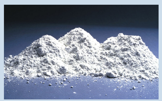
Figure 2. White cement provides a neutral base for mortars whether they are white or tinted. The sand can have a tinting effect on mortar, so it should also be carefully selected for color.

requirements of ASTM C144 and be free of silt or clay fines. Buff or brown sands used to produce white mortar will impart a darker undertone to mortar color. This effect may become more pronounced over time, or with cleaning, as sand particles are exposed due to erosion of the white mortar paste. To assure whitest mortar color, use only white sand.