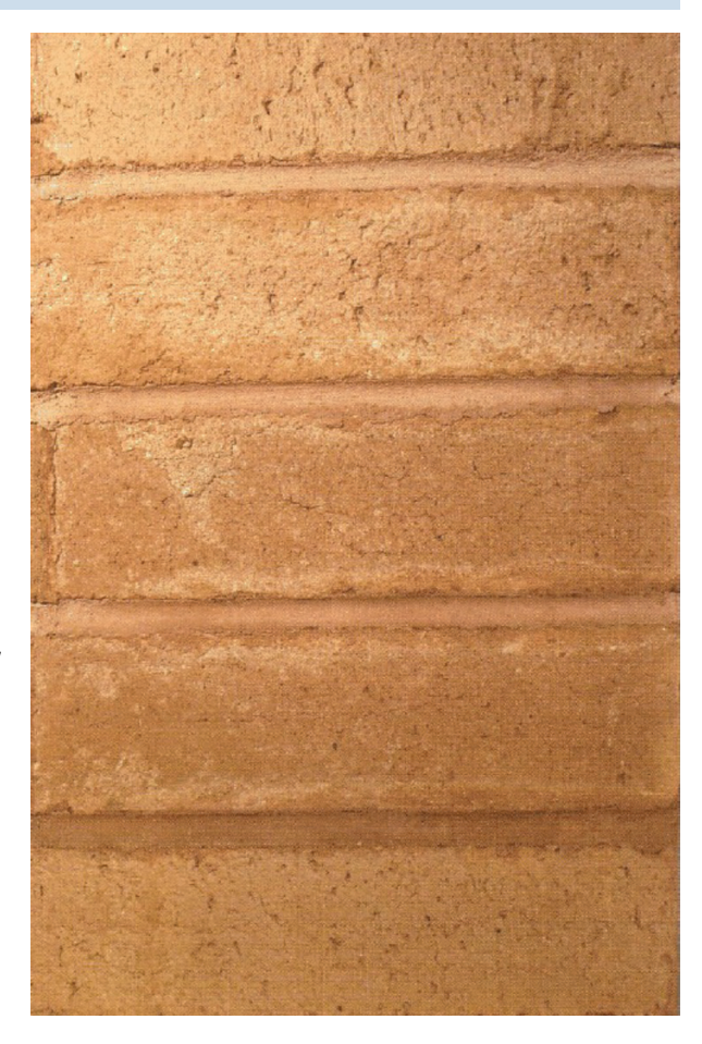
Figure 4. Made with one batch of mortar, these joints show the effect of mortar consistency and tooling time on mortar color. The top mortar joint was tooled immediately after placement of the unit. Remaining mortar joints were tooled at progressively greater time intervals and thus stiffer consistency, resulting in darker colors.

Mechanical mixing of mortar is recommended. Pre-blended mortars should be mixed according to the manufacturer's recommendations. For other mortars, use instructions provided by the mortar supplier. If no mixing instructions are given, experience has shown that good results can be obtained when about 3/4 of the required water, 1/2 the sand, and all the pigments and cementitious materials are briefly mixed together. The balance of the sand and the remaining water are then added to bring the mortar to optimum working consistency. The amount of water added should be the maximum that is consistent with satisfactory workability. After all the mortar materials are combined together, they should be mixed for 3 to 5 minutes. It is advisable to mix the full 5 minutes when producing pigmented mortars.