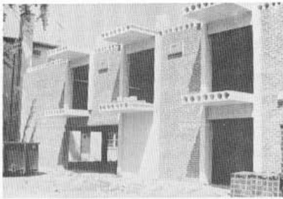
Small low-rise apartment buildings with concrete hollow-core floors forming balconies. Exterior walls are masonry. Buildings such as this will not prevent fire from starting in combustible furnishings, but fire-resistive structural elements can limit the fire to the area of origin.