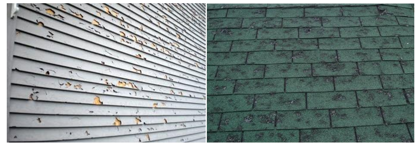
Recommended Revisions to LEED for NC and CS

Enhanced property protection is a crucial component of green construction and thus requirements for enhanced performance of exterior walls above the minimum requirements in the IBC are necessary. Such requirements reduce the amount of energy and resources required for repair, removal, disposal and replacement of exterior wall coverings damaged from hail. Property damage from hail was reported to be approximately 1.3 billion dollars in 2009 according to the National Weather Service. This proposal requires exterior wall coverings most susceptible to damage from hail be tested, classified, and labeled in accordance with UL 2218 or FM 4473 to be more robust and limited in hail exposure areas.