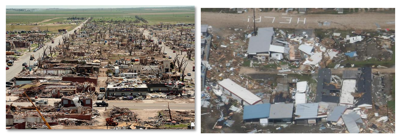
Above photographs are of Greensburg, KS (left) and after Hurricane Katrina (right)

Minimum building requirements whether through energy codes, plumbing codes, mechanical codes, zoning codes, or basic building codes, do not encourage truly sustainable buildings. The proposal is one of several that attempt to integrate the concepts of the Whole Building Design Guide (WBDG) into the minimum design and construction criteria for "green" buildings. The WBDG, developed in partnership between the National Institute of Building Sciences (NIBS) and the Sustainable Building Industries Council (SBIC), has as its key concepts: accessible, aesthetics, cost-effective, <u>functional/operational</u>, historic preservation, productive, <u>secure/safe</u>, and sustainable.