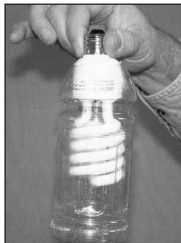
2004 General Facility Winning Entry The Monarch Cement Company Humboldt, Kansas