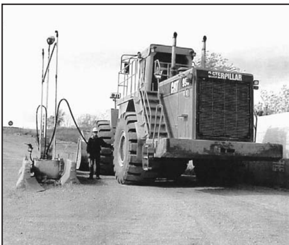
2004 Quarry Winning Entry GCC of America, Inc. Rapid City, South Dakota