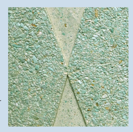
Figure 6. Lightly sandblasting over a pattern created using rubber inserts results in a surface with color, texture, and relief. A white cement matrix anchors the green aggregate (cordierite), whose color predominates.

Following finishing, concrete should receive uniform curing. Nonstaining curing compounds or faced curing blankets designed for use with white or colored concrete are the preferred method of curing. Use of waterproof paper sheets or unfaced plastic sheets ("visqueen") for curing can lead to surface discoloration.