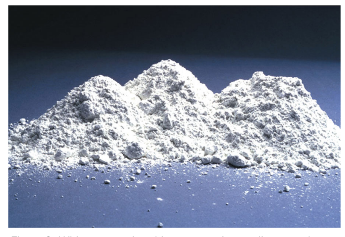
Figure 2. White cement is subject to exacting quality control procedures that minimize color variation during manufacturing.