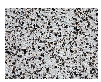
Figure 5. This panel is a good example of white cement and white and black aggregate (milky quartz and black obsidian) used to create a salt-and-pepper appearance.

concrete. When natural sands lack the required whiteness for white concrete, crushed limestone or quartzite sands may be a good option. Manufactured sand often adds valuable color tone and can be made to a uniform color appearance. Since color is strongly affected by the fine aggregate, the gradation should be carefully controlled, especially for the finest portion of the material.