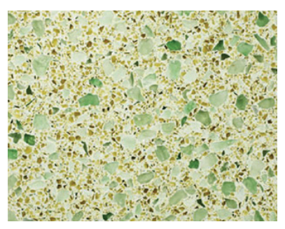
Figure 4. Colorful aggregates stand out even more when used in a white cement-based concrete.

Aggregates account for the largest volume of the concrete, so the overall color and appearance can be influenced by the color of the fine and/or coarse aggregates (depending on the depth of exposure) (see Fig. 4). Pigments of similar color can be used to tint the cement paste and enhance the basic concrete color established by the aggregates.