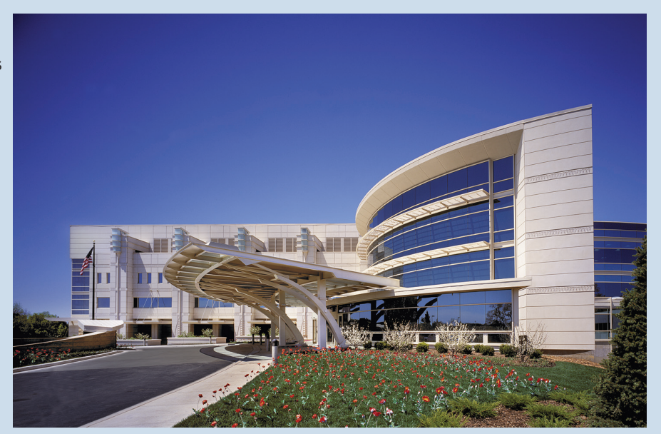
Figure 1. The Condell Medical Center is built with load-bearing precast concrete panels with an architectural finish achieved by using white cement.

Because of its versatility, concrete offers endless design possibilities. A wide variety of decorative looks are achieved by using colored aggregates and pigments, and by varying surface finishes, treatments, and textures. Combining white cement with pigments and colored aggregates expands the number of colors available to discerning customers. Colors are cleaner and more intense because pigments and specialty aggregates don't have to overcome the grayish paste of common concrete.