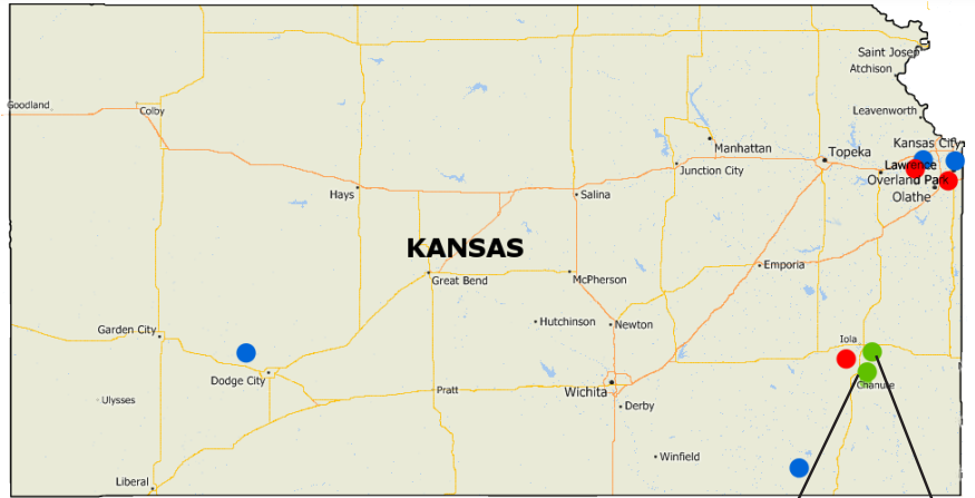
Ash Grove Monarch