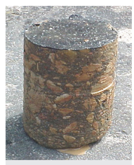
Pavement core proves strength of CTB. Even in severe climates the strength of CTB increases due to continued cement hydration.

Cores taken from soil-cement pavements furnish proof of its strength. Samples taken after 15 to 20 years show considerably greater strength than samples taken when the pavement was initially built. Because the cement in soil-cement continues to hydrate for many years, soil-cement has "reserve" strength and actually grows stronger.