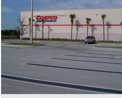
Soil-cement parking lots offer low initial cost and fast construction

The use of soil-cement can be of great benefit to both owners and users of commercial facilities. Its cost compares favorably with that of granular-base pavement. When built for equal loadcarrying capacity, soil-cement is almost always less expensive than other low-cost site treatment or pavement methods. The use or reuse of in-place or nearby borrow materials eliminates the need for hauling of expensive, granular-base materials; thus both energy and materials are conserved.