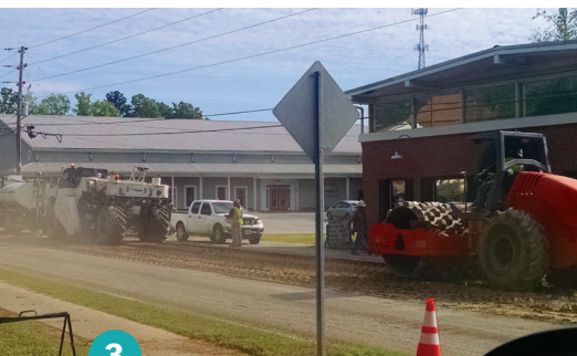
Overnight construction near railroad crossing