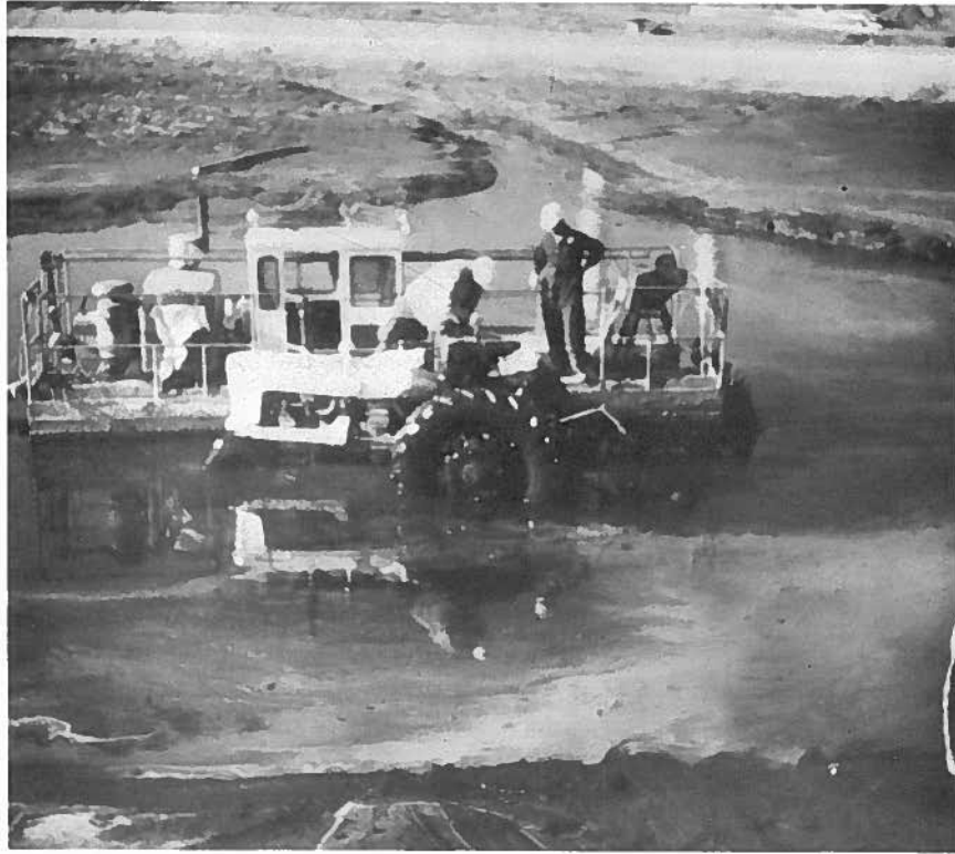
Sludge removal with dredge and farm-type tractor.