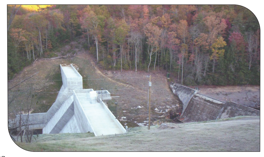
Big Cherry Dams soon after construction of the new dam.

Before constructing the new roller-compacted concrete (RCC) dam, the 4 million gallons (15.1 million liters) per day capacity water treatment plant produced an average water supply of approximately 1.7 MGD (6.4 MLD) which was very near the safe yield of the old reservoir. The water treatment plant will be able to safely treat over 3 MGD (11 MLD) with the new dam and increased reservoir storage in place.