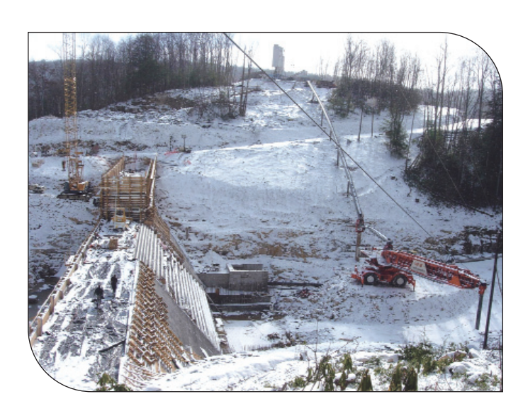
RCC mixing plant and conveying system. Photograph was taken during cold weather shutdown

mix consisted of 3,684 lb/yd³ (2,189 kg/m³) of a crushed basalt aggregate having a specific gravity of 2.70 to 2.75. Mix design and test section results indicated that the desired strength could be achieve with a total cementitious content of 258 lb/yd³ (153 kg/m³) at the proportions of 50% cement and 50% fly ash. This is equivalent to about 7% cementitious material by dry weight of aggregate. The water content was approximately 220 lb/yd³ (131 kg/m³).