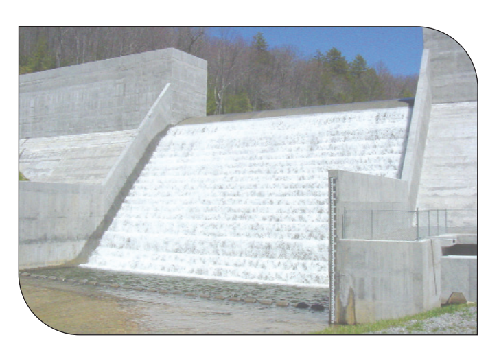
Spillway operating for the first time in April 2006

The lowest bidder, Estes Brothers Construction, was awarded the contract for a base bid price of approximately $6 million. The dam's remote location and construction site